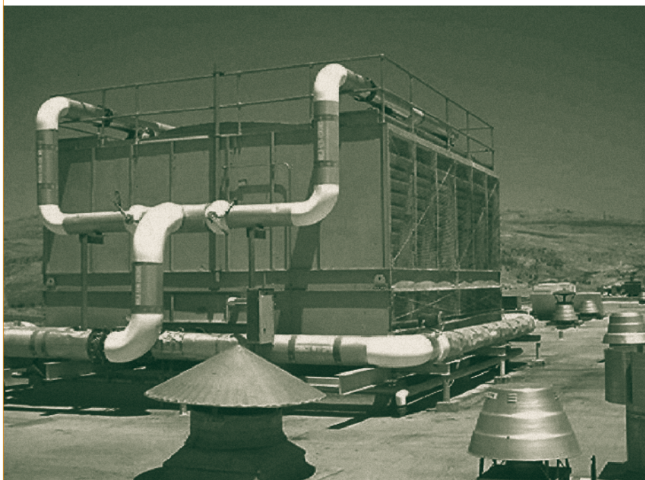
Modified Central Plant Cooling Tower Installation.

PowerLight Corporation contracted with its strategic partner, CMS Viron Energy Services (which was acquired in 2003 by Chevron Energy Solutions), to