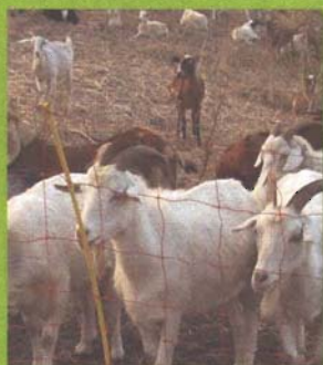
Good for the goats, good for the land. Goats replace herbicides on Alameda County hillsides.

These lessons are applied to construction as well. Ninety-four percent of the JJC's construction waste was diverted from landfills. Recycling that much debris required creative