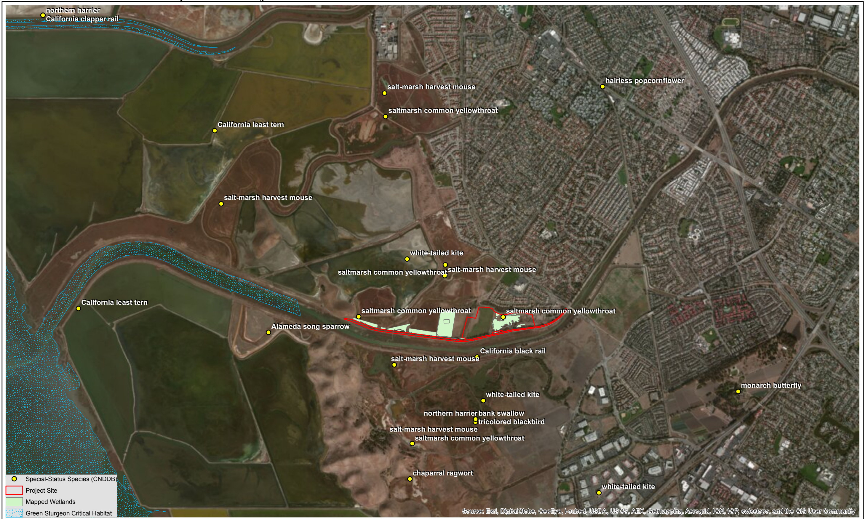
Figure 3: Local CNDDDB MAP Alameda Creek North Levee Improvement Project

Note that the wetland mapping only covered areas within and bordering the project site to the north. Habitats south of the project site and associated with Alameda Creek would not be affected by the project.