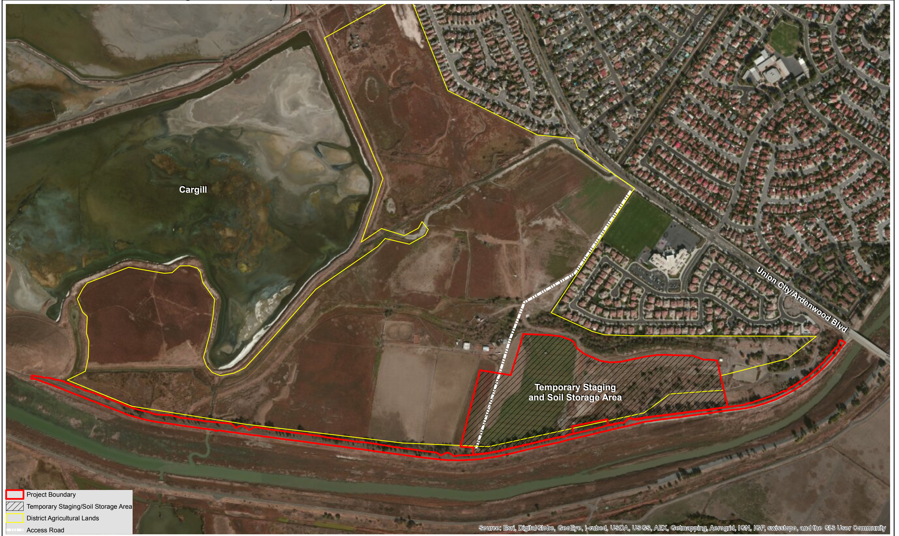
Figure 2: Project Site Alameda Creek North Levee Improvement Project