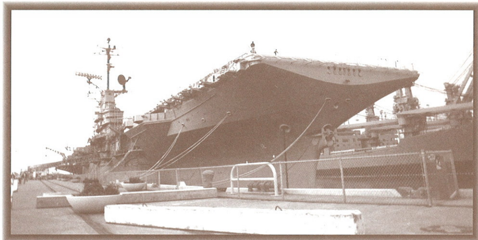
The USS Hornet moored at historic Alameda Point participated in World War II and the Apollo 11 manned space mission.