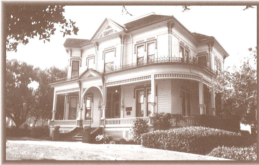
McConaghy victorian estate built in 1889 on Hesperian Blvd. in San Lorenzo.