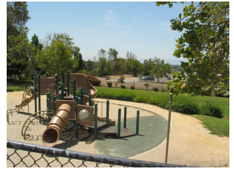
Playground in the Eden Area