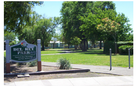
Del Rey Park in San Lorenzo