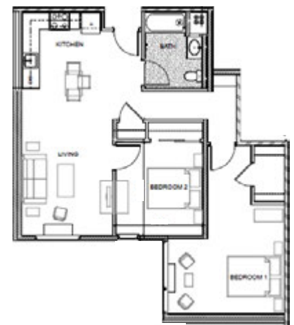
Two Bedroom One Bath Approx. 880 sq. ft.