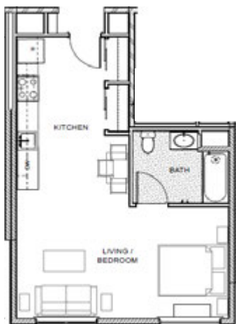
Studio One Bath Approx. 405 - 476 sq. ft.

**Each San Lorenzo preference household will be entered into the random drawing lottery 3 times. Inquire for further details.